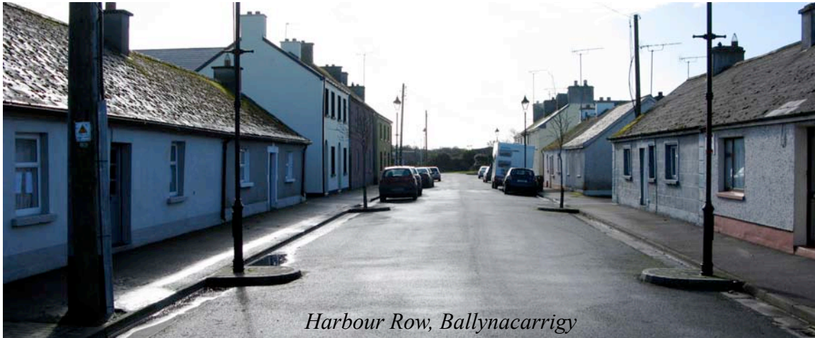
Harbour Row, Ballynacarrigy